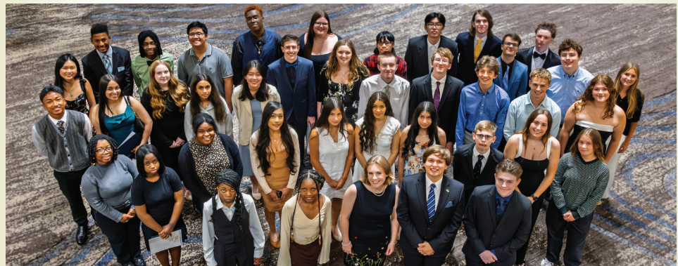
2025 Teacher Mini-Grant Recipients

Virginia Educators Credit Union supported this year's Newport News Public School's Salute to Success Student Recognition program as a Top Scholar Sponsor. The Valedictorians and Salutatorians and top ranked high school students in each grade level in Newport News Public Schools were honored and recognized along with the National Merit Scholarship honorees, seniors who have earned four or more Industry Certifications, and the 2025 recipient of the Wayne D. Lett Scholarship program. The sponsorships for this program also support the NNPS teacher mini grants which provide teachers with extra funding for classroom initiatives up to $500 each. Congratulations to these outstanding students and teachers recognized!